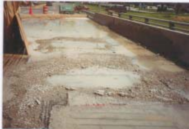
Figure 2: Note the straw bails covered with burlap at the end of the bridge to filter waste water.

The biggest concern from this first project was about the vacuum truck backing onto the rebar mat and bending it down where concrete was removed below the top mat. The heavy truck (Figure 3) worked all right here. However, if a lot of reinforcing steel is showing, plywood would need to be placed under the truck tires to distribute the load better. Alternately, a hand guided vacuum, or one with a boom (Figure 4), which didn't have to travel over the rebar could be substituted for the truck.