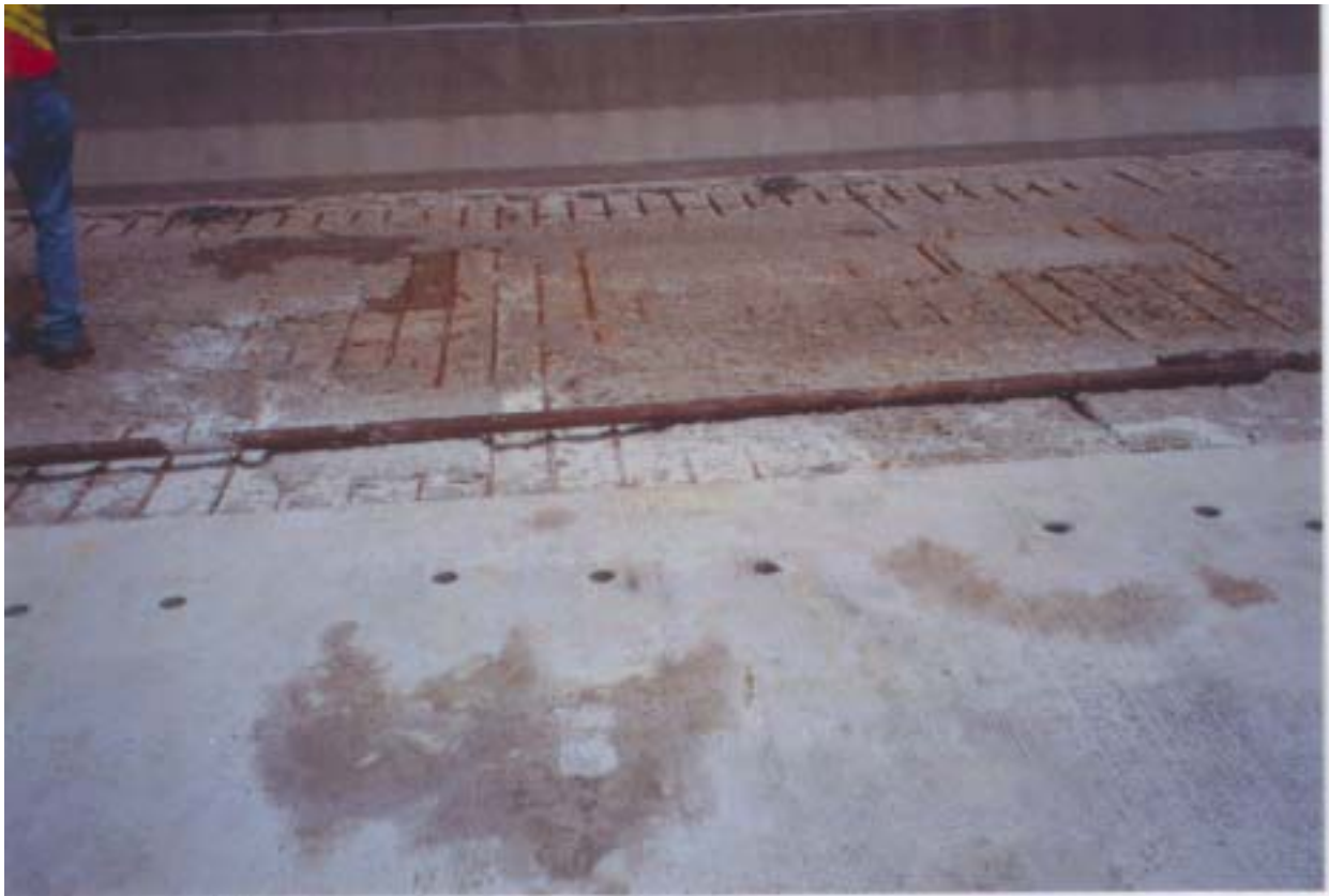
Figure 6: Finished hydrodemolition of half (background) of Bridge A0174 E. In the foreground, new latex modified concrete overlay. Note: 2" core holes in the overlay are where pull-off tests for direct tension were taken.

Because of staged construction, this project required two mobilizations of the hydrodemolition equipment. The westbound bridge was closed to traffic in 1998. The whole deck of the westbound structure, 7,100 sf., was completed. The hydrodemolition contractor returned in early 1999 to do the 7,100 sf. of the eastbound bridge (Figure 6). Even though two trips were required, it is believed the bid was lower than expected due to being able to hydroblast a fairly large amount of surface each trip. Also, no traffic control was needed since the bridges were shut down to traffic.