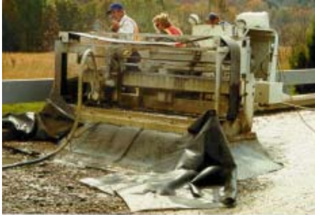
Figure 1: Hydro machine in action. (Note the rubble in front, compared to the milled deck behind.)

the hydroblast machine over the whole bridge, 5,800 square feet, or $ 2.06/sf. This price included vacuuming up the debris and dumped on site. MoDOT maintenance forces were used to haul the rubble away. MoDOT also had to set up straw bail dams to catch the solids in the water before it was allowed to enter the roadway ditch. The effluent was checked by MoDOT to supply information on turbidity to the Missouri Department of Natural Resources to make sure it passed clean water standards.