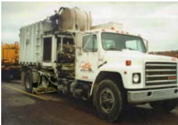
Figure 3: Heavy, self contained vacuum truck . Note: vacuum nozzle located in front of the rear wheel works very well to pick up debris.

The biggest concern from this first project was about the vacuum truck backing onto the rebar mat and bending it down where concrete was removed below the top mat. The heavy truck (Figure 3) worked all right here. However, if a lot of reinforcing steel is showing, plywood would need to be placed under the truck tires to distribute the load better. Alternately, a hand guided vacuum, or one with a boom (Figure 4), which didn't have to travel over the rebar could be substituted for the truck.