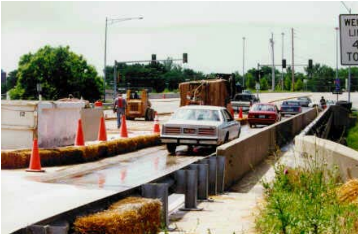
Figure 5: Shows traffic control and containment of blast water while hydroblasting for patches in two center lanes of a four lane bridge.

Repairing these 7 bridge decks (the complete overlay of Br. L-868 plus patching of 6 others) was done in 20 working days using hydrodemolition. It would have taken 60 days by normal hand methods.