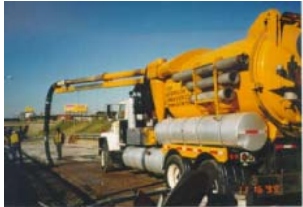
Figure 4: Vacuum truck with hose on boom; can stay off rebar mat but is slower picking up debris.