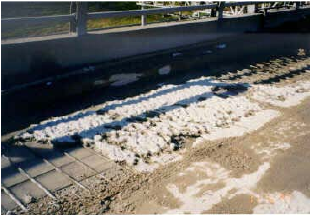
Figure 7: Poor concrete and a thin 6 1/2” upper deck made it necessary to do hydrodemolition at 13,000 psi . This is after the first pass (Note how clean the re-steel is in the foreground on the left). A second pass with the hydro-blaster was necessary to remove the island of unsound concrete left over the rebar in the center of the photo.

Bridge A-185R Ramp on Route I-70, St. Louis City was shut down due to construction in the area. MoDOT maintenance forces took this opportunity to again use hydrodemolition work to repair this bridge deck. A maintenance contract was let for hydrodemolition. The cost was $29.09/sy ($ 3.23/sf) which compared well with the only construction project MoDOT had let with hydrodemolition, discussed above, which bid at $ 31.50/sy ($ 3.50/sf ). Poor concrete and a thin 6 1/2” upper deck on this type box girder bridge made it necessary to make two passes with the hydrodemolition machine set at 13,000 psi. (see Figure 7) One pass at the normal setting of 17,000 – 18,000 psi would have blown through the poor quality concrete. Hydrodemolition makes it easier to regulate than conventional methods with regards to how much concrete is removed when it’s necessary to patch and keep open a badly deteriorated deck.