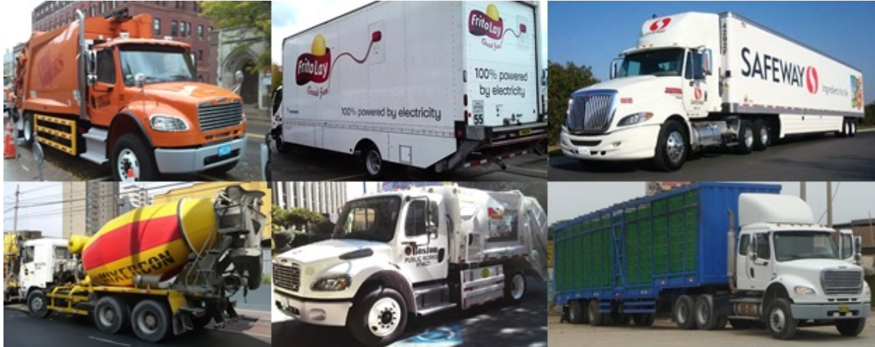
Truck side guards are shown installed on single-unit as well as combination trucks. At top right, a rigid aerodynamic side skirt installed on a trailer.

73 pounds to the weight of the truck. VRU side guards could potentially be built even lighter and still meet the minimum strength requirements of the Volpe standard .